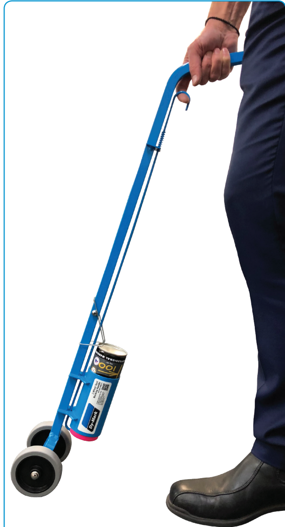
Example of how to use the 2-Wheel Spot Marking Handle.

Note: Only compatible with the following products which have the upright/inverted spray nozzle (Trigger cap), as shown below: